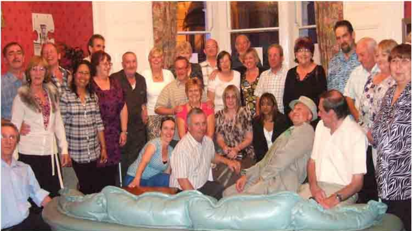
PLYMOUTH GROUP PHOTO WITH AS MANY MEMBERS AS WE COULD SQUEEZE IN !!